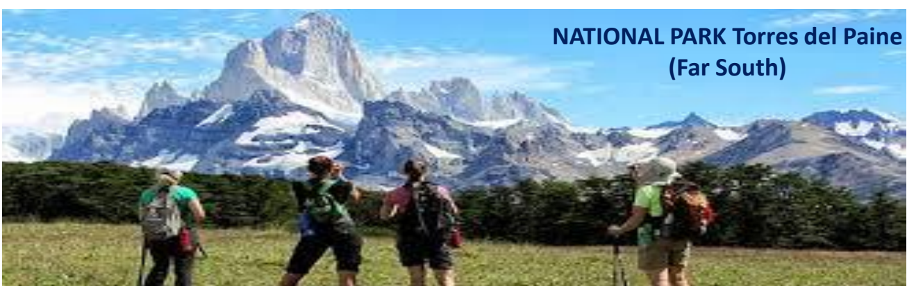
Thank you and we are waiting for you in the Spring of Chile